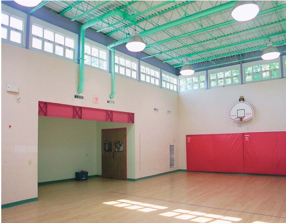
Auxiliary Gym for Younger Grades